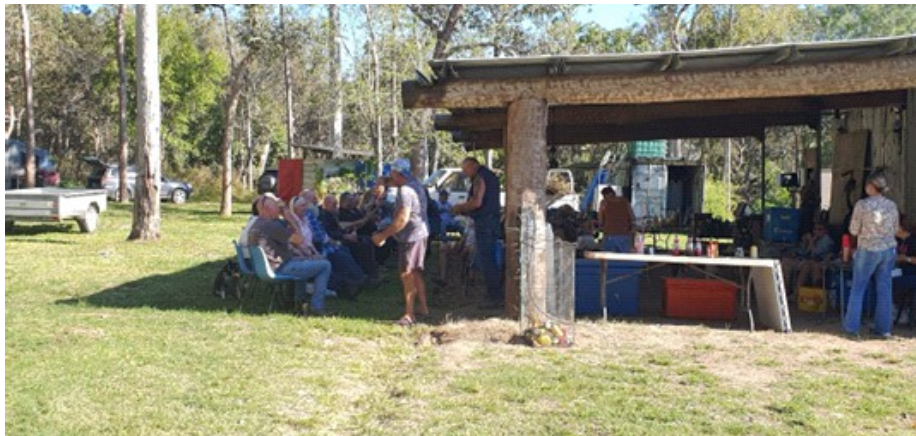
Food and refreshments as the sun is going down at Upper Stone.